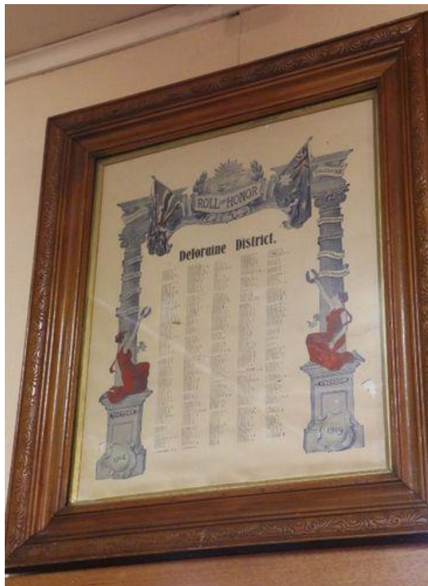
Deloraine District Roll of Honour