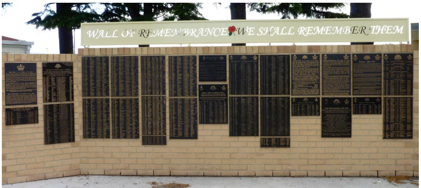
Wall of Remembrance, St. Helens, Tasmania

"What these men did nothing can alter now. The good and the bad, the greatness and the smallness of their story will stand. Whatever of glory it contains nothing now can lessen. It rises, as it will always rise, above the mists of ages, a monument to great hearted men; and for their nation, a possession forever. "