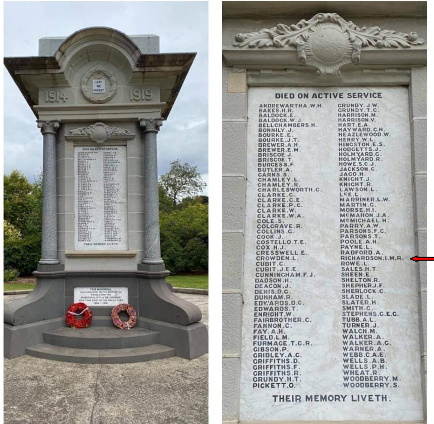
Deloraine War Memorial