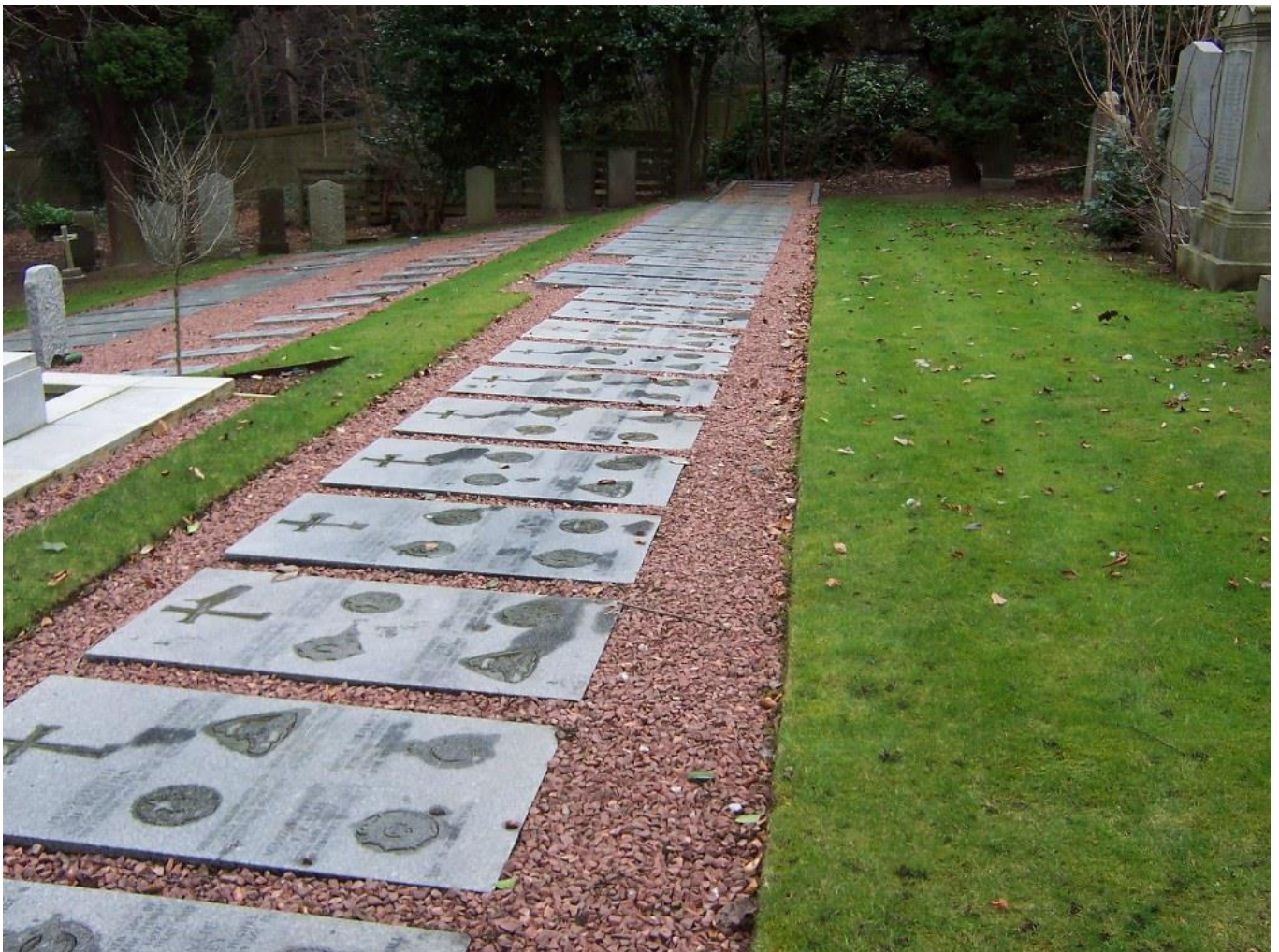
Communal Commonwealth War Graves plot in Section D

An unusual feature of the War Graves plot is that the granite headstones lie flat. This was a decision made by the architect, Sir Robert Lorimer. The plot contains WW1 and WW2 casualties/Spanish Flu victims and a member of the Finnish Legion.