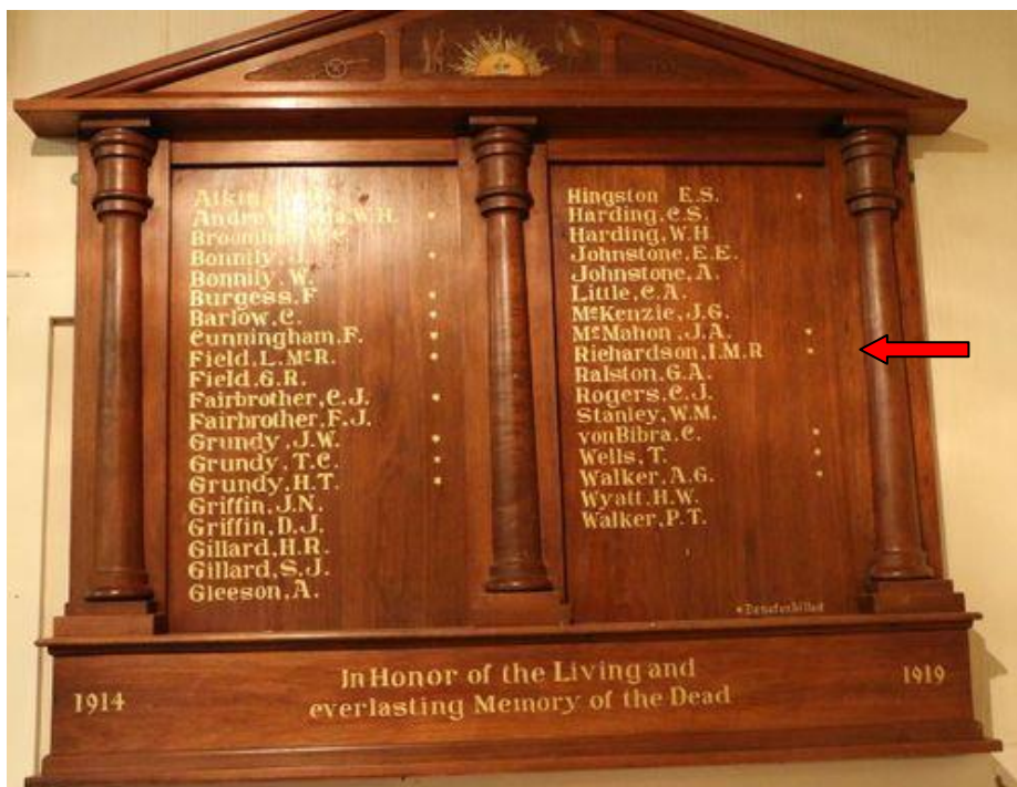
Deloraine Honour Roll